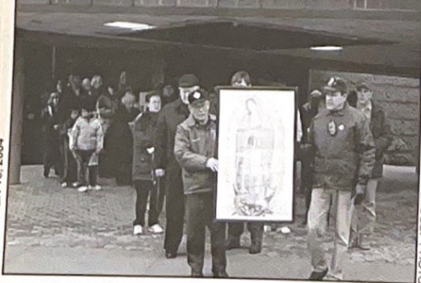
THE TABLET, DECEMBER 18, 2004